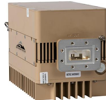
With AC module