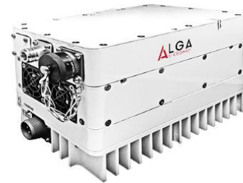
With AC module