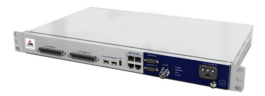
Transcend VP Indoor Unit (IDU)