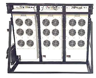
1:2 Redundant Version