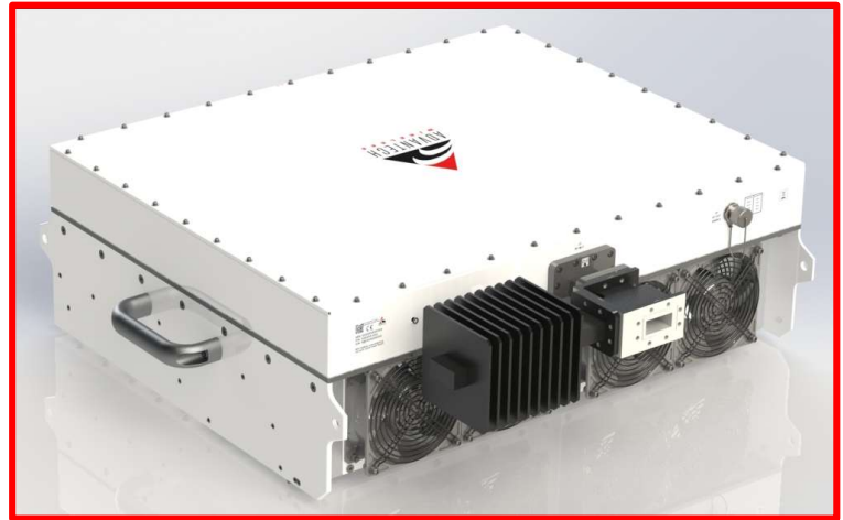
800W C-Band SSPB

The new Genesis-Series of C-band SSPA/SSPBs from Advantech Wireless Technologies epitomizes the latest in hardware and software technologies, making it the most feature-rich satcom SSPA in the industry. Available in 600W and 800W C-band, the Genesis-Series SSPA/SSPB delivers the high-end features discriminating users have come to expect.